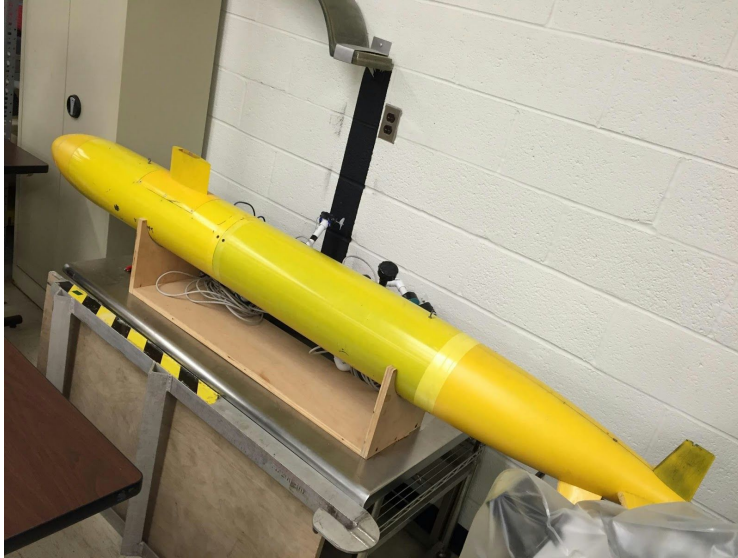
Figure 2: Previously Constructed Model Submarine Hull